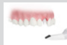
Abutment level impression and create final crown

An abutment level impression or intraoral scan is made to proceed with the final crown restoration.