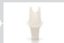
Order a 2nd final abutment