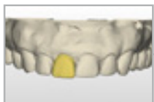
Desired crown - Model scan with wax-up or CAD