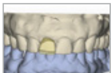
Opposing dentition in occlusion - Intraoral scan or model scan