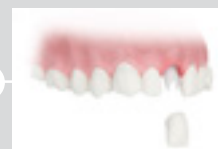
Place final crown