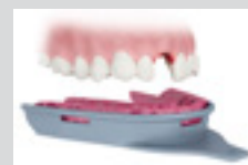
Implant level impression

A new Atlantis Abutment is ordered. The final crown can be fabricated using conventional methods on a master model or from the Atlantis Abutment Core File