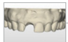
Dentition and soft tissue - Intraoral scan or model scan